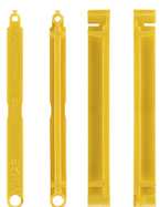
V71563 - Joint plate for flush-mount boxes yellow