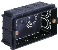
V71304.AU - Flush mounting box 4M black