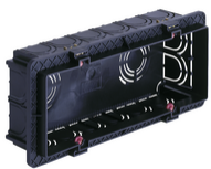
V71306.AU - Flush mounting box 6-7M black