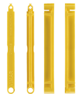
V71563 - Joint plate for flush-mount boxes yellow