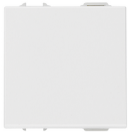
09013.2 - 1P 16AX reversing switch 2M white